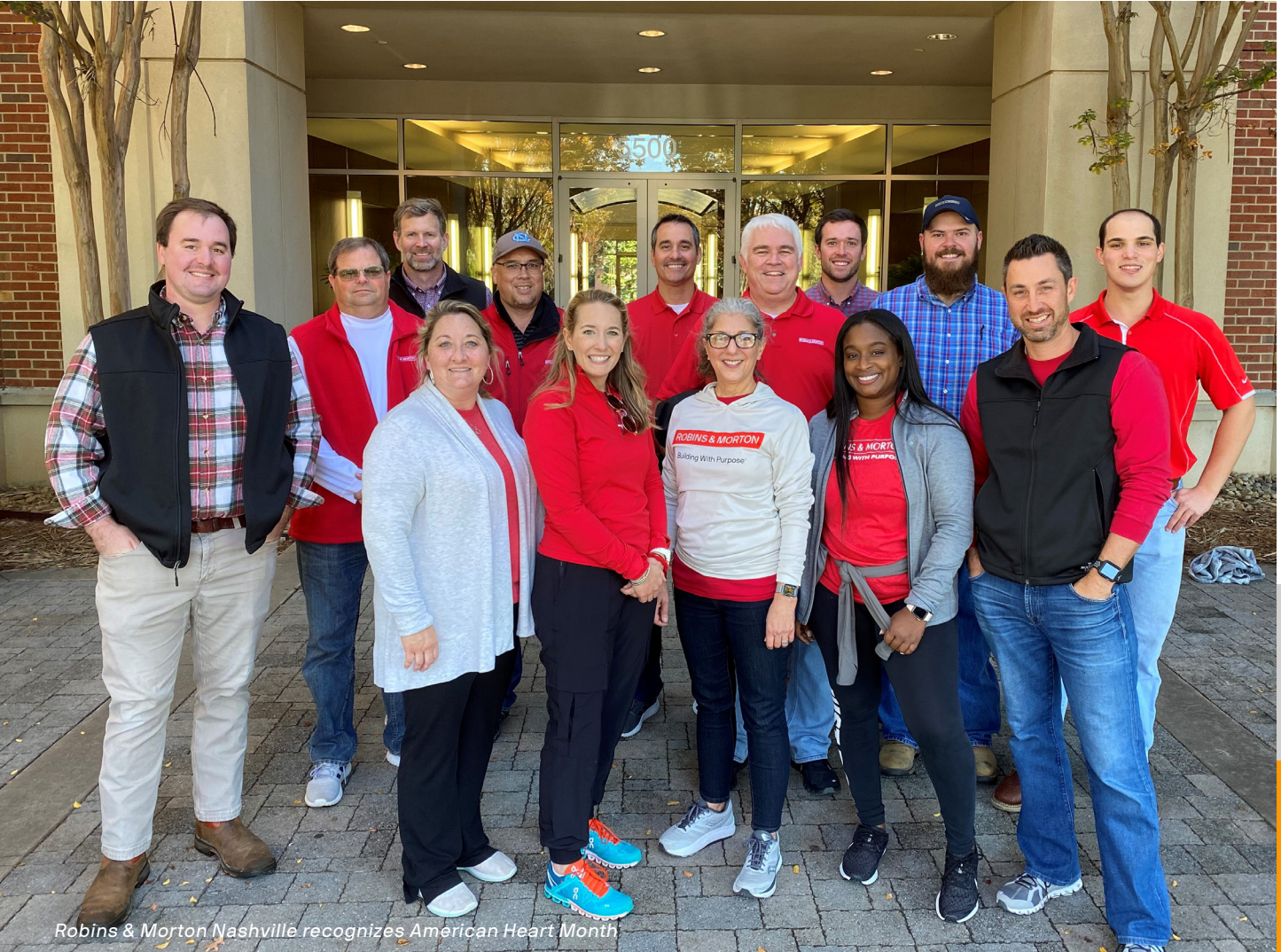
Robins & Morton Nashville recognizes American Heart Month