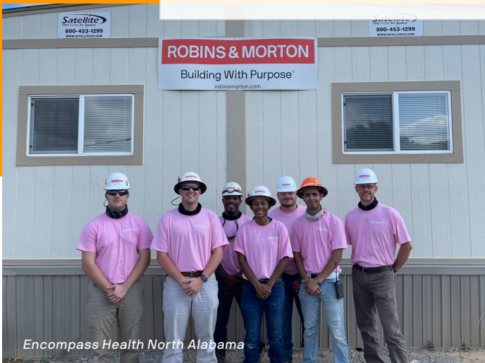
Encompass Health North Alabama