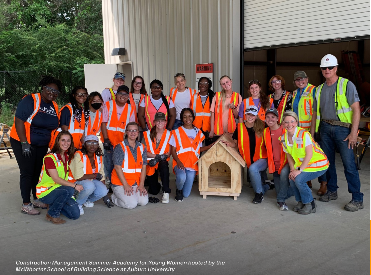
Construction Management Summer Academy for Young Women hosted by the McWhorter School of Building Science at Auburn University