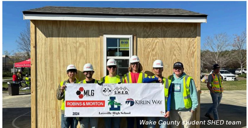
Wake County student SHED team

Our Raleigh team members provided guidance and instruction to a team of students as part of the 2024 Student Hands-on Experience Day (SHED) competition. Dozens of Wake County, North Carolina, high school students participated in the shed-building competition, led by Connect for Success NC. The annual event gives students the opportunity to explore what a potential career in construction could be like.