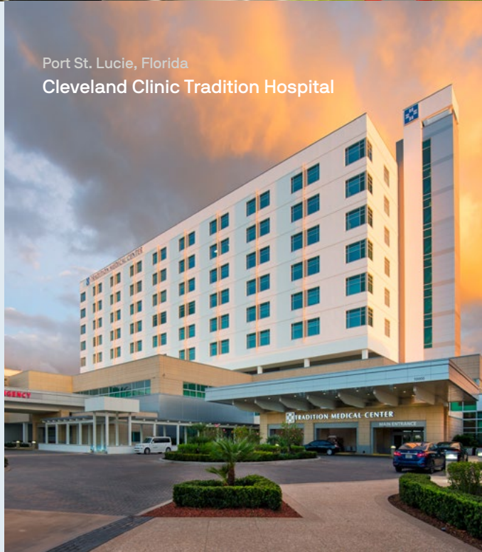
Port St. Lucie, Florida Cleveland Clinic Tradition Hospital

Cleveland Clinic Tradition Hospital (formerly Tradition Medical Center) relied on the experience of Robins & Morton to succeed with a three-phase expansion and renovation that could satisfy the rapidly increasing population of Port St. Lucie, Florida. The high-risk project entailed a vertical expansion built directly on top of and aligned with the existing hospital structure. Directly below the construction site was a maternity department, neonatal intensive care unit and a cardiac catheterization lab, which required careful planning that would keep these units fully functioning and safe.