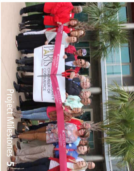
Project Milestones 5