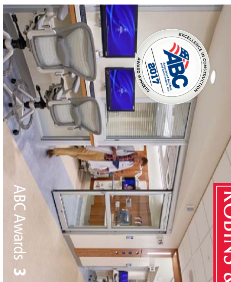
ABC Awards 3