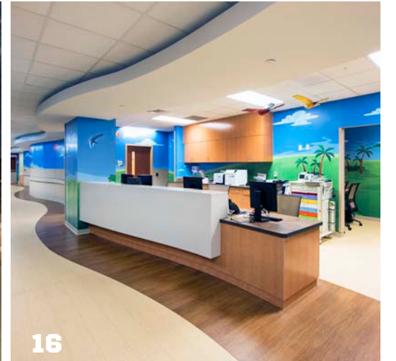
Projects and their locations are identified on the back panel.