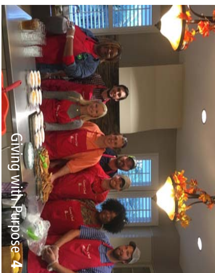
Giving with Purpose 4