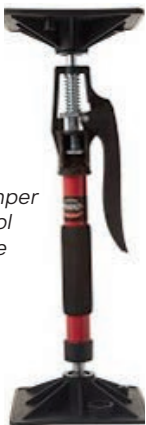
Fire Damper Reset Tool Prototype